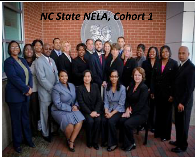
NC State NELA, Cohort 1

NC State selects Fellows who: have high expectations and share the belief that all children can achieve at high academic levels; have a sense of urgency and personal accountability for achieving results for students; have a deep commitment to equity and community engagement; possess a deep knowledge of curriculum and instruction and monitors teacher effectiveness; and have strong resiliency skills to persevere when confronted with setbacks.