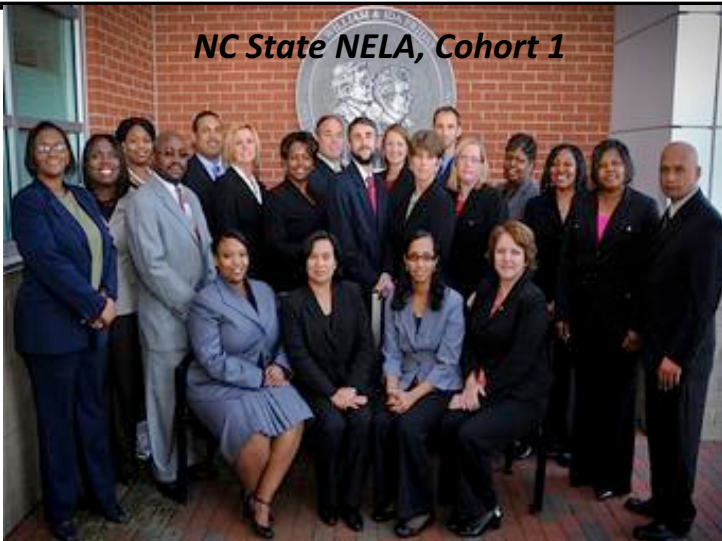
NC State NELA, Cohort 1

NC State selects Fellows who: have high expectations and share the belief that all children can achieve at high academic levels; have a sense of urgency and personal accountability for achieving results for students; have a deep commitment to equity and community engagement; possess a deep knowledge of curriculum and instruction and monitors teacher effectiveness; and have strong resiliency skills to persevere when confronted with setbacks.